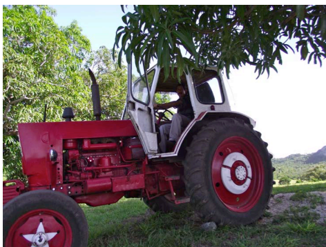
1980's Russian tractor purchased to advance production in 20-acre church farm

The average wage for a teacher or medical doctor is $25 a month ($600 pesos). You can imagine what ordinary people earn! Ration cards have been issued to provide monthly allotments of staples like rice and beans. But these supplies, at the most, only last a week. So people are forced to find food in the underground economy.